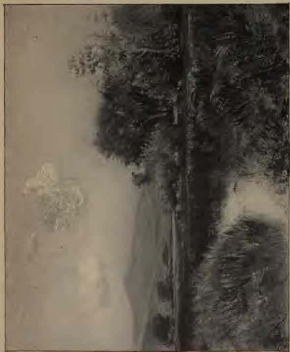
"O SKIES, SERENE AND BLUE!"